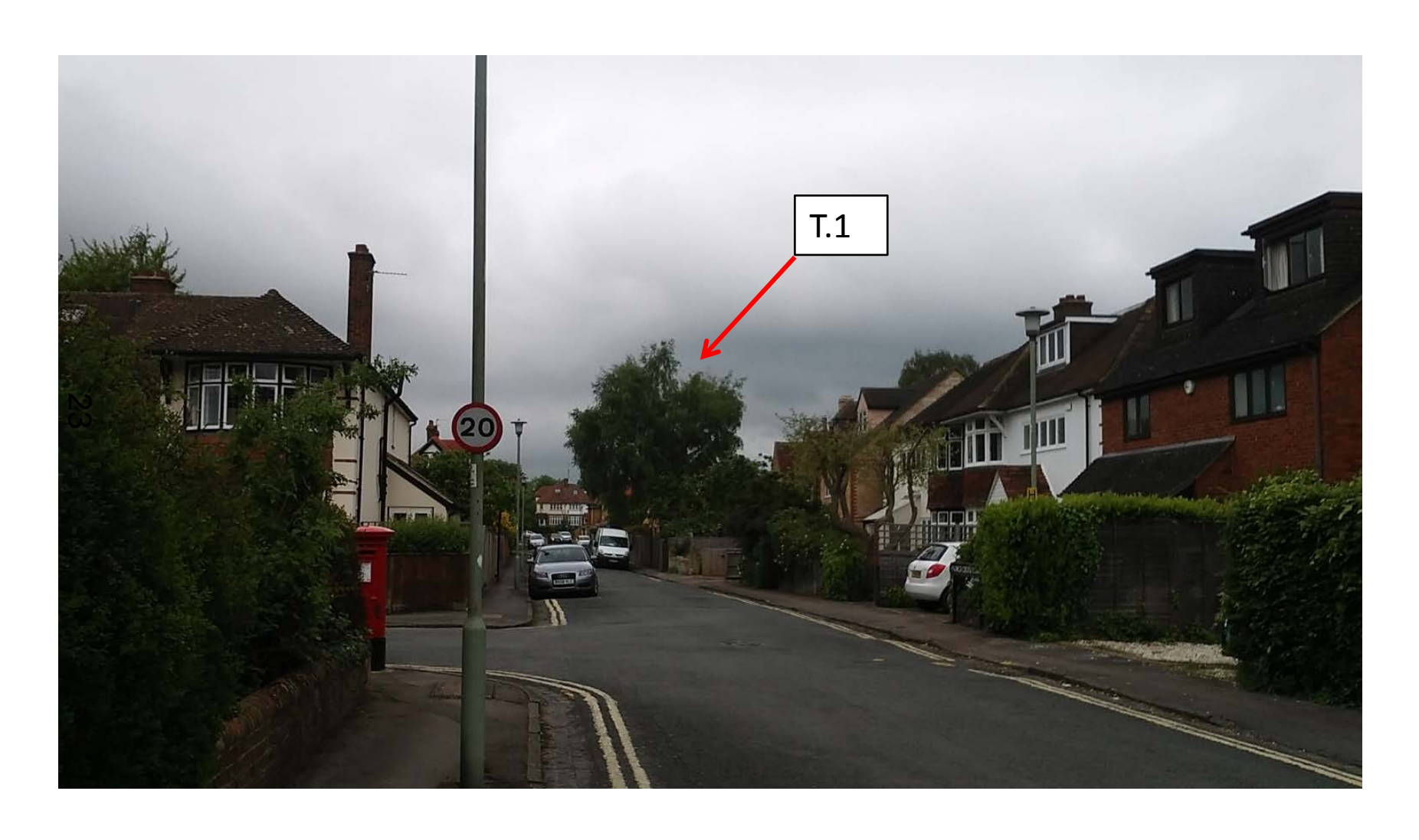
View north along King's Cross Road