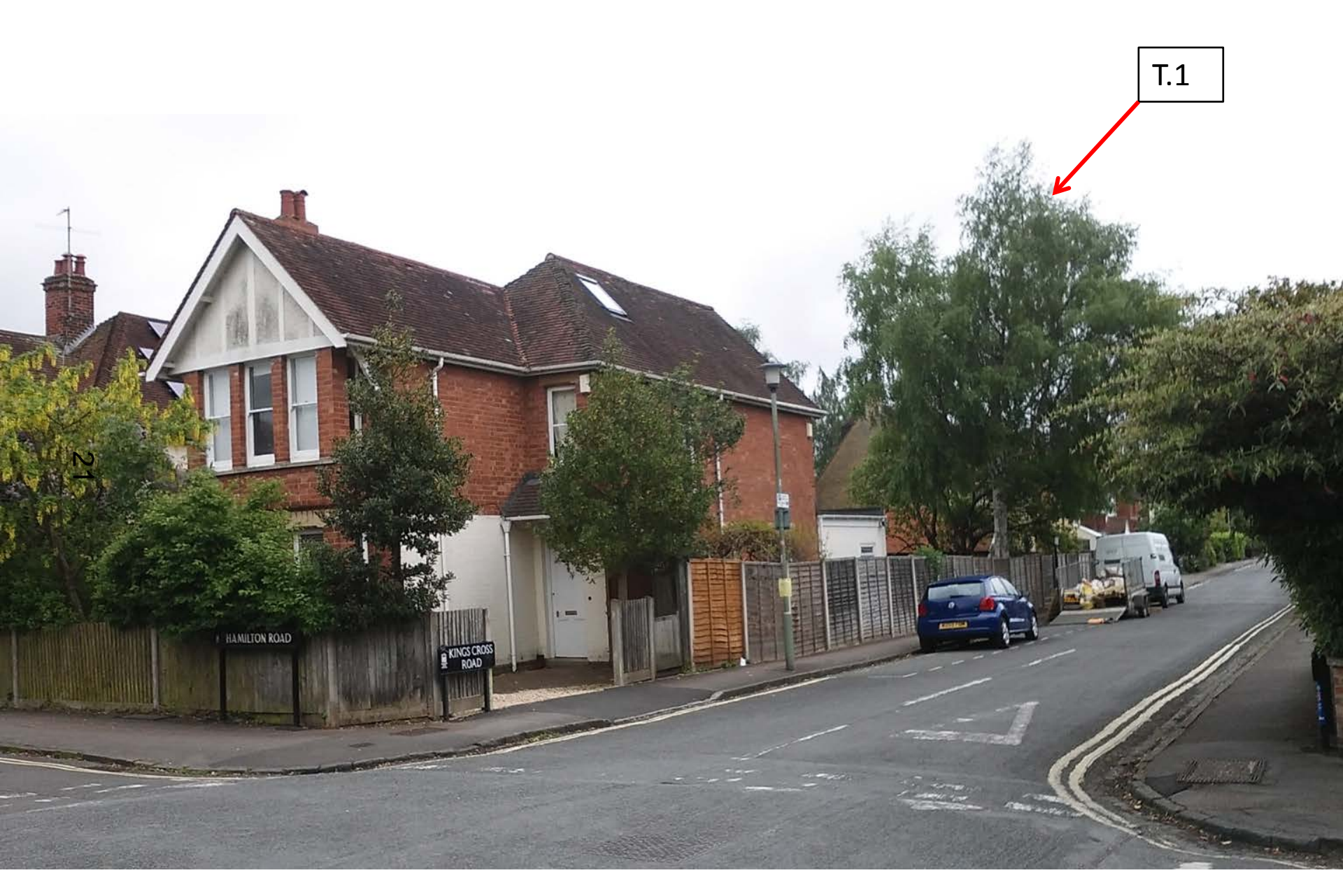
View southeast from junction of Hamilton Road and King's Cross Road